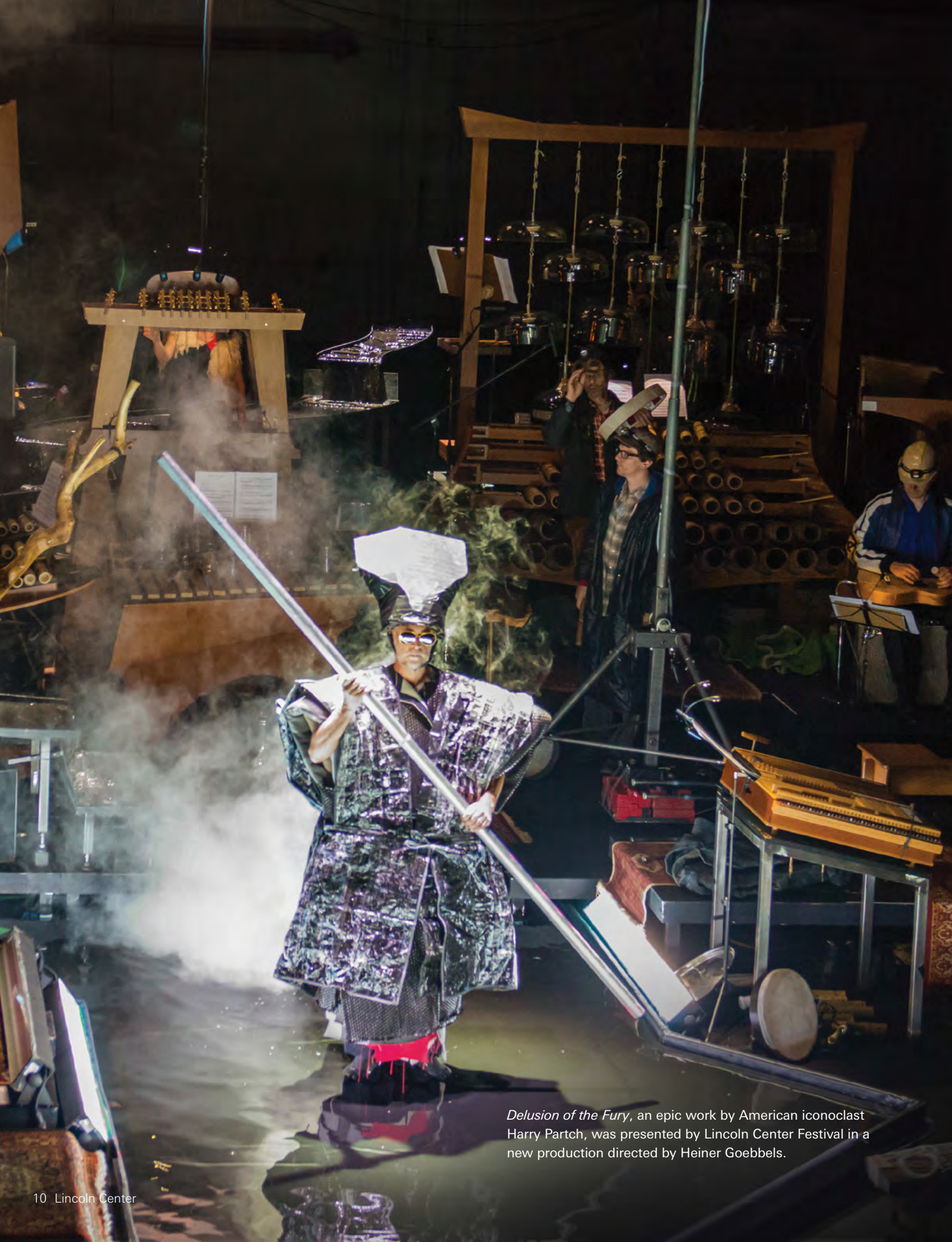
Delusion of the Fury , an epic work by American iconoclast Harry Partch, was presented by Lincoln Center Festival in a new production directed by Heiner Goebbels.