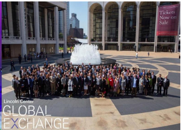
200 Founding Members- Artists, Policy Makers, CEOs and Dignitaries- gather for a inaugural photo. Lincoln Center's Global Exchange, September 18 2015.